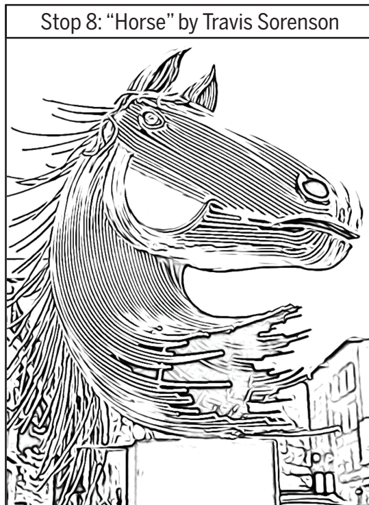
Stop 8: "Horse" by Travis Sorenson